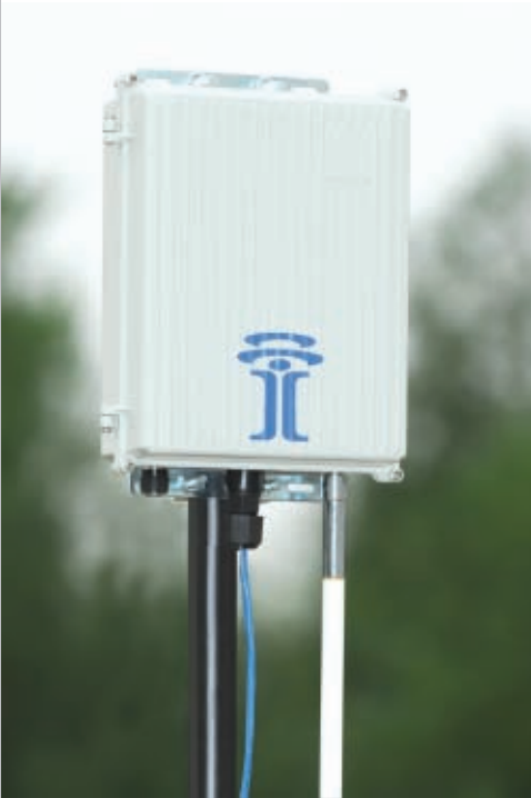
SA (STAND-ALONE) UNIT

Providing Reliable, High-Speed Connectivity Across Multiple Locations