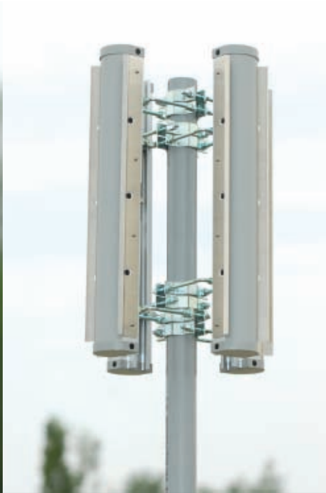
ACCESS POINT CLUSTER